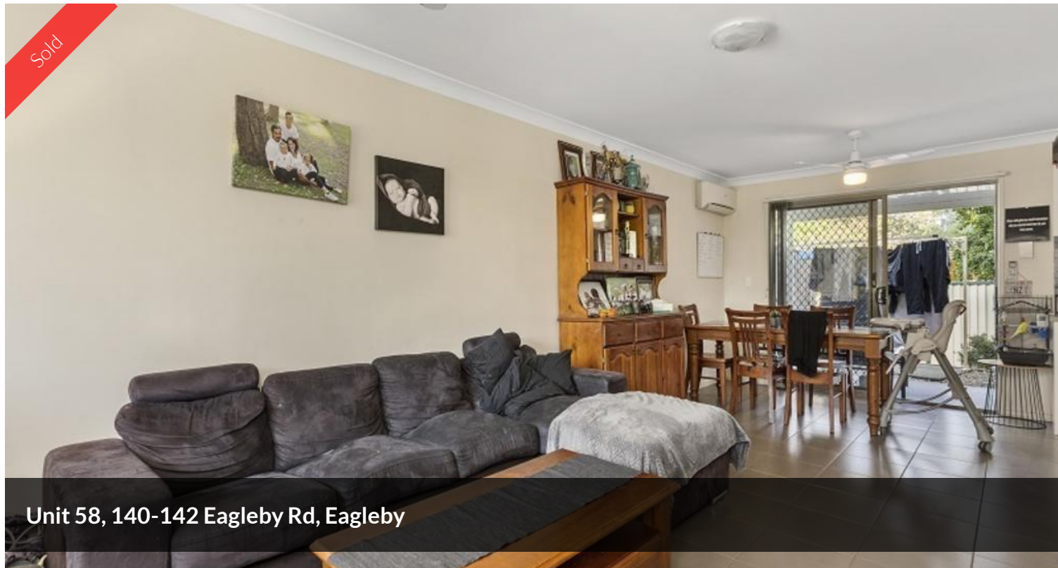
Unit 58, 140-142 Eagleby Rd, Eagleby