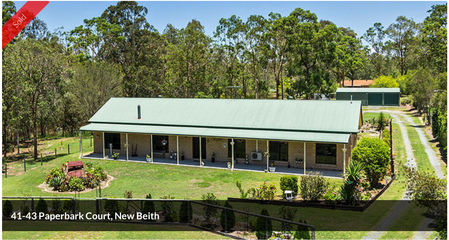
41-43 Paperbark Court, New Beith