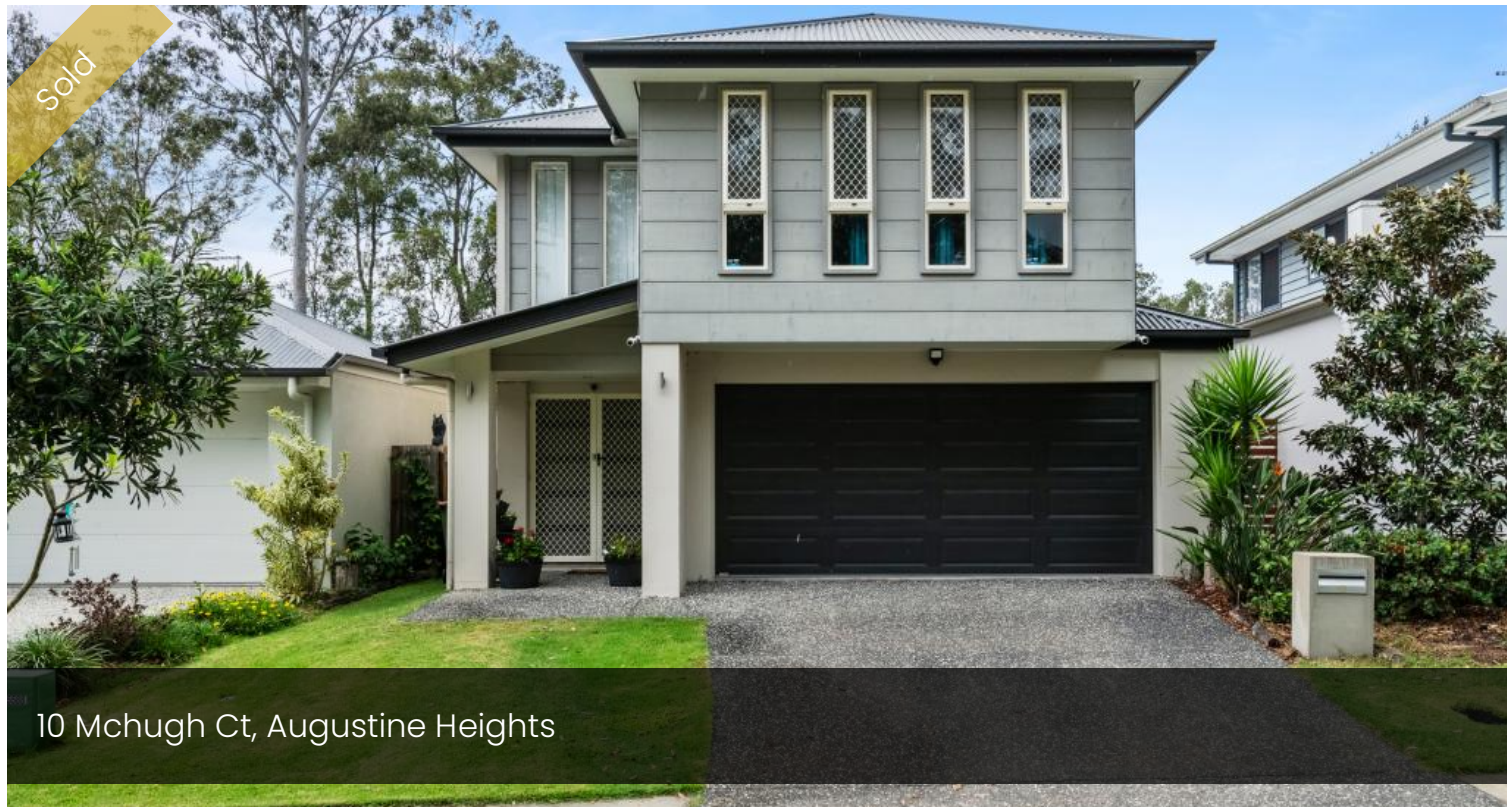
10 Mchugh Ct, Augustine Heights