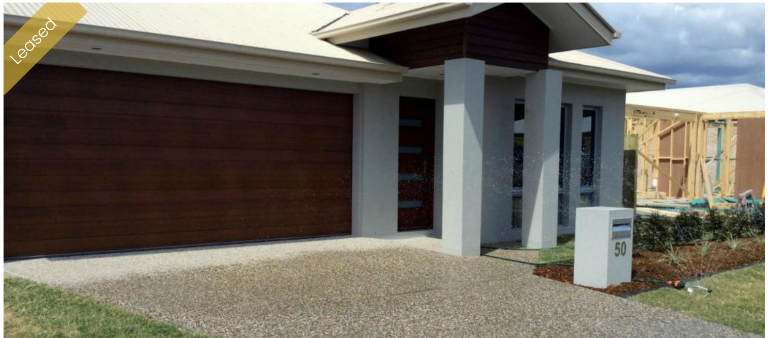
50 Stoneleigh Reserve Boulevard, Logan Reserve